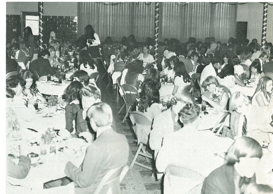
Capacity crowd enjoys food provided by Seniors.