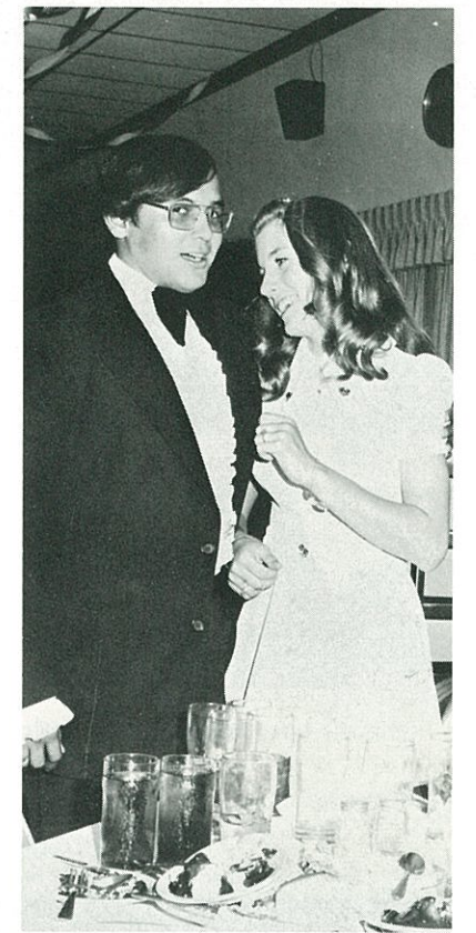
And you can't have her!