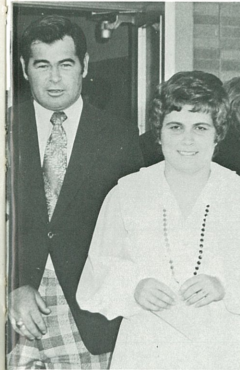
Sugarbear & wife