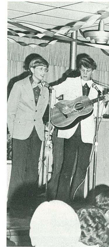
EXCITING Mediocre Fred