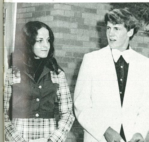
Glad that's over with!